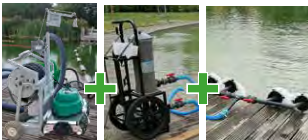
ROBOT WITH PREFILTER