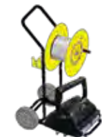
Reel (optional) k00044n000