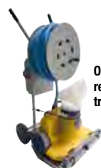
Optional reel trolley